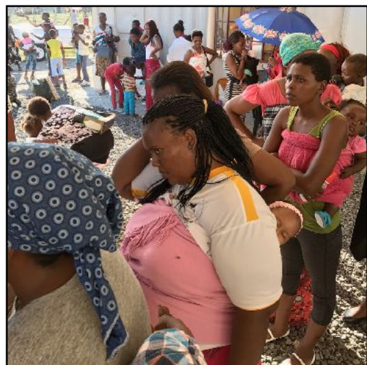
Standing in line to receive baby supplies.

I recently got a note from one of our partners saying that he was spending money on feeding birds and pets, and God is challenging him to also spend money on feeding children. If you are feeling a similar tug and would like to be a part of expanding our baby care program (and shrinking our waiting list), by giving monthly, please visit our website at EngageAfrica.com under the Hope Church tab (the direct link is in the email) or mail your investment to Engage Africa; 2250 W. Highland Ave.; Elgin, IL 60123.